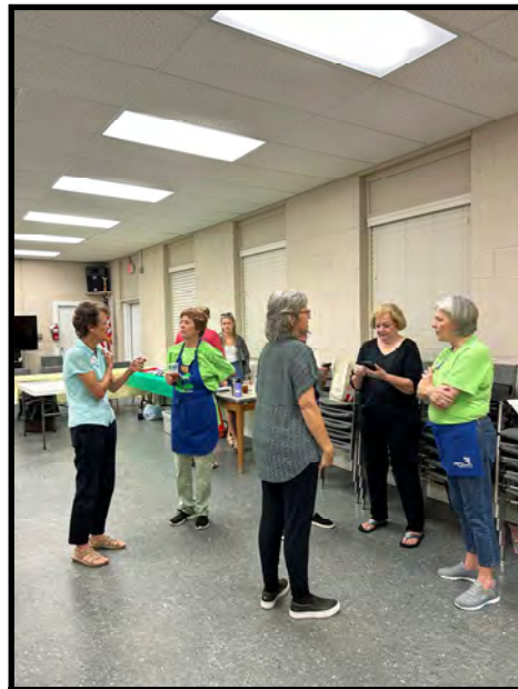
Waiting for kids to brave the storm.

One of the many workshop highlights was the Auburn Insect Lab “Bug Team”. They drove for 5 hours in the middle of intense rain storms to be at our Kids Nature Day. They did a workshop on the kinds of bugs found in gardens. (The bugs were deceased and in glass bottles). The big hit was the large hairy (dead) Tarantula which both the kids and the adults were allowed to touch. An interesting experience.