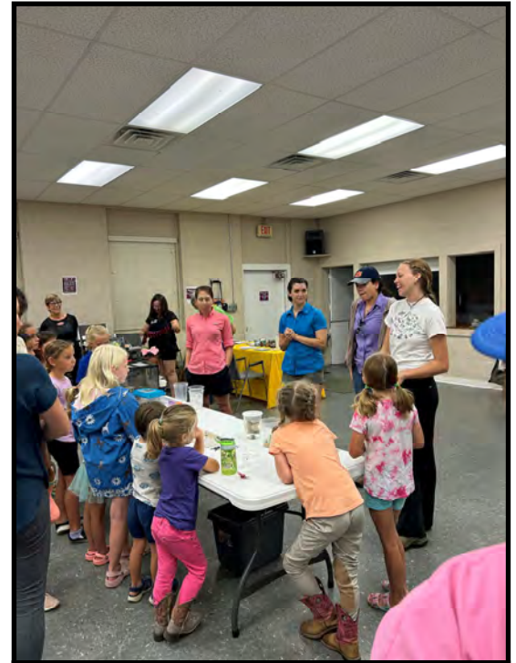
Guests from Auburn—“Bug Team”