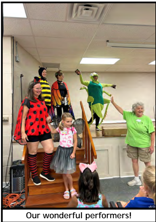
Our wonderful performers!