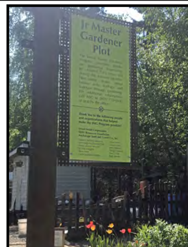
Jr. Master Gardener Plot

The only “butterfly” I saw all week turned out to be a day-flying moth, the Argent and Sable.