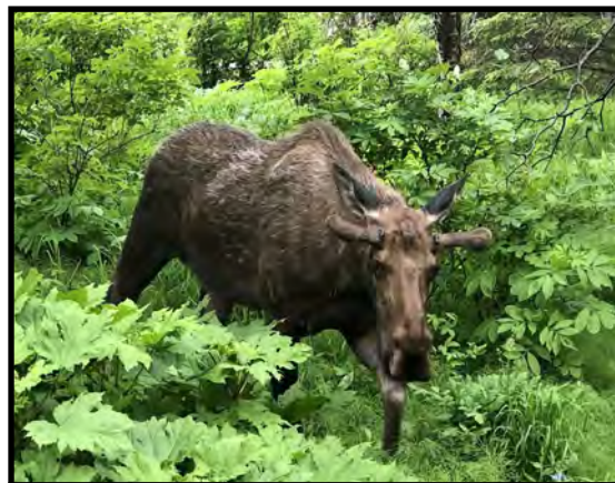
Moose and Cow Parsnip

The main trees we saw in Alaska were birch and spruce with thickets of shrublike green alders. On Chugach State Park’s Flattop Mountain Trail, the flowers on the alders caught my eye. They have both male and female “catkins.” The male flowers are long and dangling, and the female flowers look like small pinecones. Those stay on the branches and are a good way to identify alders at any time of year.