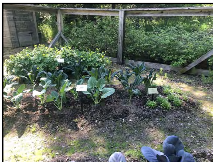
Cabbage and Kale

The Anchorage Botanic Garden sections ranged from the fancy hardscape in Lile’s Garden, inspired by the 1940’s gardener and philanthropist, Lile Bernard Rasmussen, to the very plain homesteaders’ Heritage Garden. The vegetables there included horseradish, beets, cabbage and kale, our winter vegetables. Tomatoes would need to be grown in a greenhouse to extend the growing season.