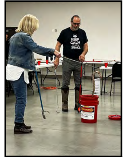
Copperhead in training