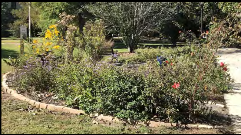
The Native Plant Pollinator Garden is filling in nicely after 18 months. It's a great source of seeds.

We work Tuesdays and Fridays and would welcome more volunteers whenever you can make it. We're also looking for seeds, cuttings and divisions of native plants. Contact Mary Calvin