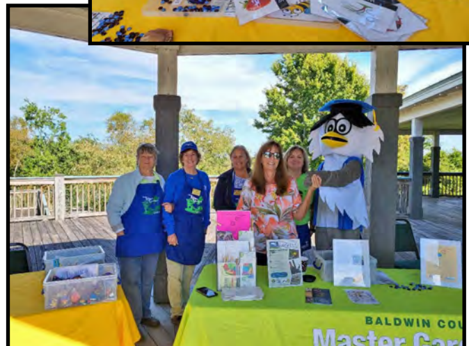
(Continued on page 4)