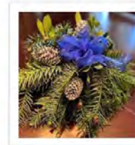
Table Arrangement $30

Select your first and second ribbon color choice for the arrangement.