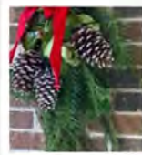
Swags $30 each