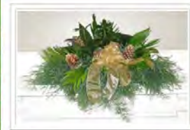
Mantle Arrangement $30