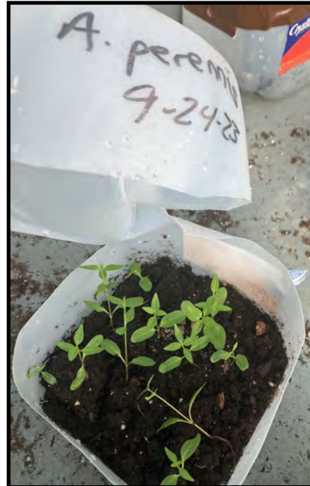
Aquatic Milkweed, Asclepias perennis . We are growing native milkweed to improve the health of local Monarchs.

We work Tuesdays and Fridays and would welcome more volunteers whenever you can make it. We're also looking for seeds, cuttings and divisions of native plants. Contact Mary Calvin