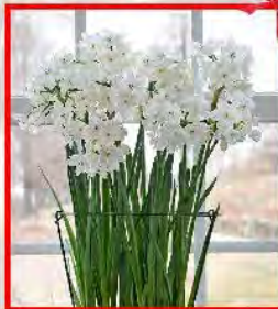
Potted Paper Whites