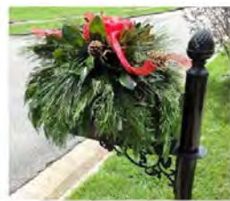
Large Mailbox Topper $45