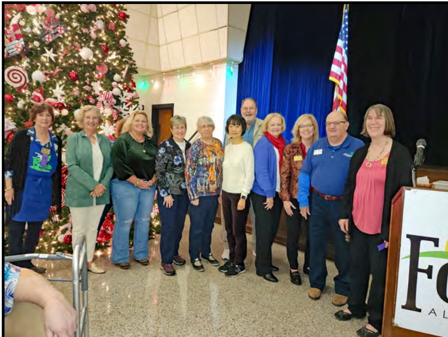
Changing of the Guard – Your 2024 BCMG Board