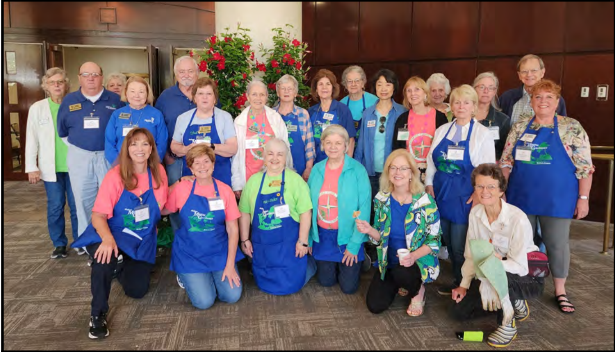
Our Wonderful Volunteers!